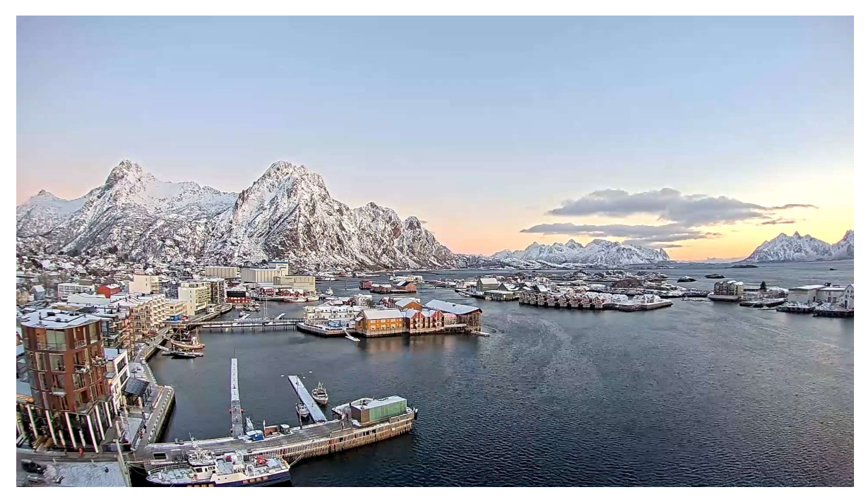
View from the conference venue, November 29th 2023

The conference fee is €250. The fee covers reception, conference, lunches, conference dinner and technical tour. The fee does not include accommodation. Accompanying persons are welcome to join the reception, conference dinner and technical tour. Accompanying persons fee is €125. Registration forms will be issued in April.