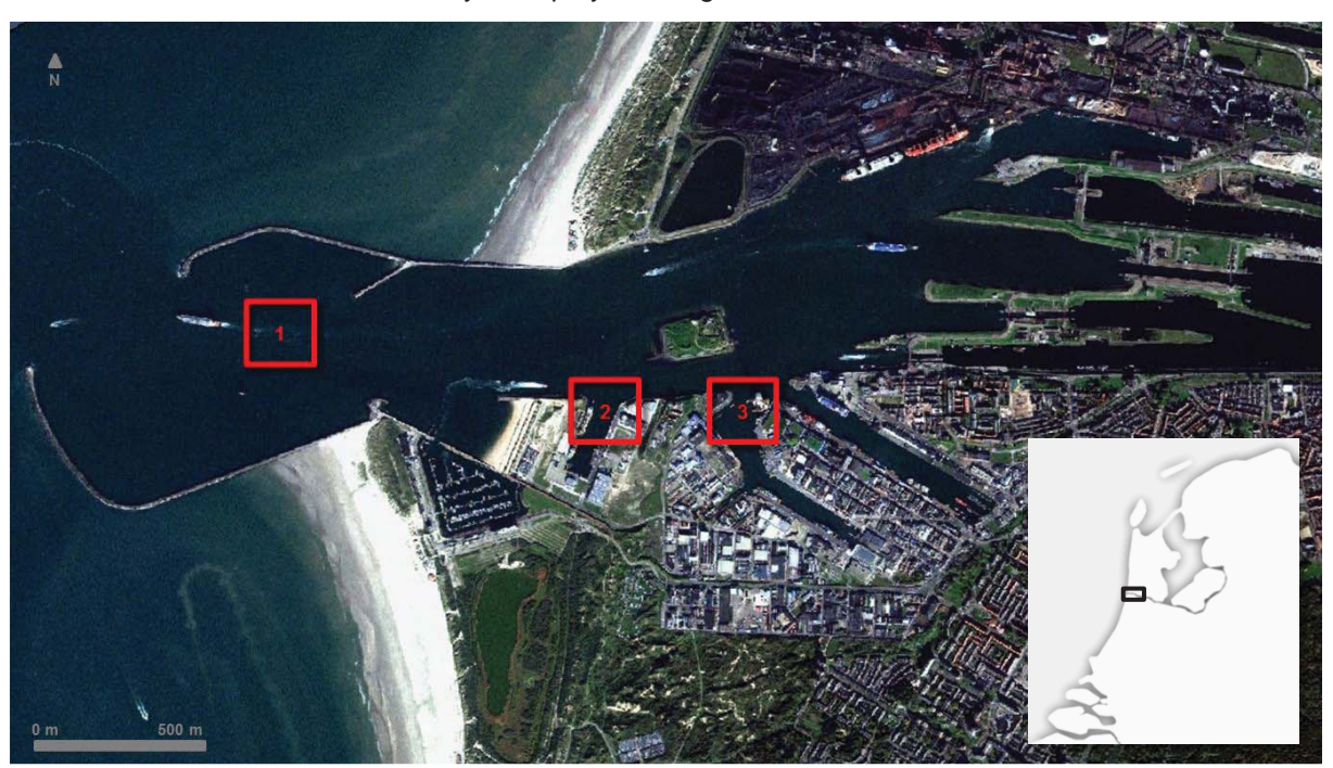
Figure 3: Study locations within the Port of IJmuiden notified in red with (1), (2) and (3). The location of the port within the Netherlands is displayed in black on the map of the country.

A case study is conducted to illustrate the application of the framework. Selected is the Port of IJmuiden in the Netherlands, approximately 20 kilometers west of Amsterdam. An overview of the port and the focus locations for this study is displayed in Figure 3.