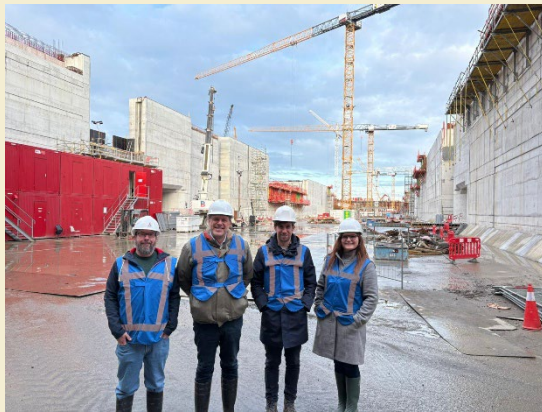
InCom WG 265 - Meeting in Belgium