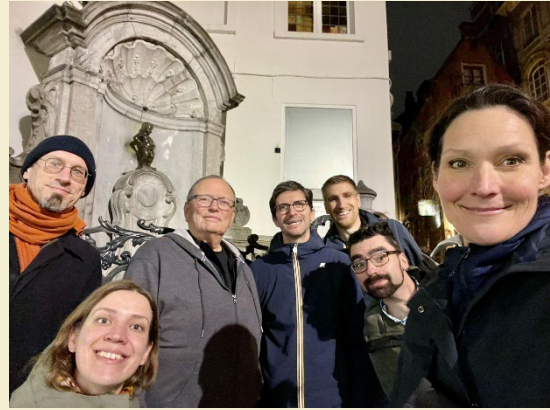
InCom WG 255 - Meeting in Belgium