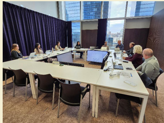
InCom WG 267 - Kick-Off Meeting in Belgium