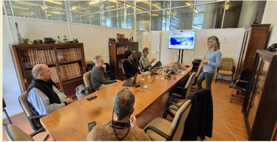
MarCom WG 233 - Meeting in Portugal