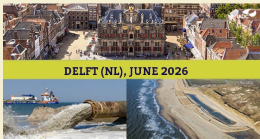
DELFT (NL), JUNE 2026

In June 2026, Delft will become an international hub for dredging knowledge and professional exchange, as two complementary dredging education programmes take place.